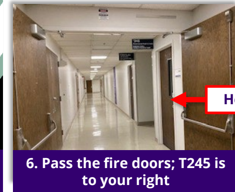
6. Pass the fire doors; T245 is to your right