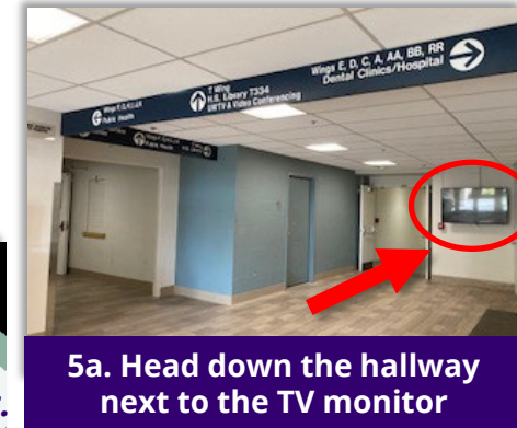
5a. Head down the hallway next to the TV monitor