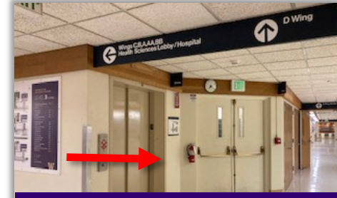
3. At D-wing intersection, take the stairs/elevator to 2 nd Fl