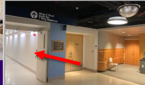
4. On 2 nd Fl, follow signs to T-wing & library