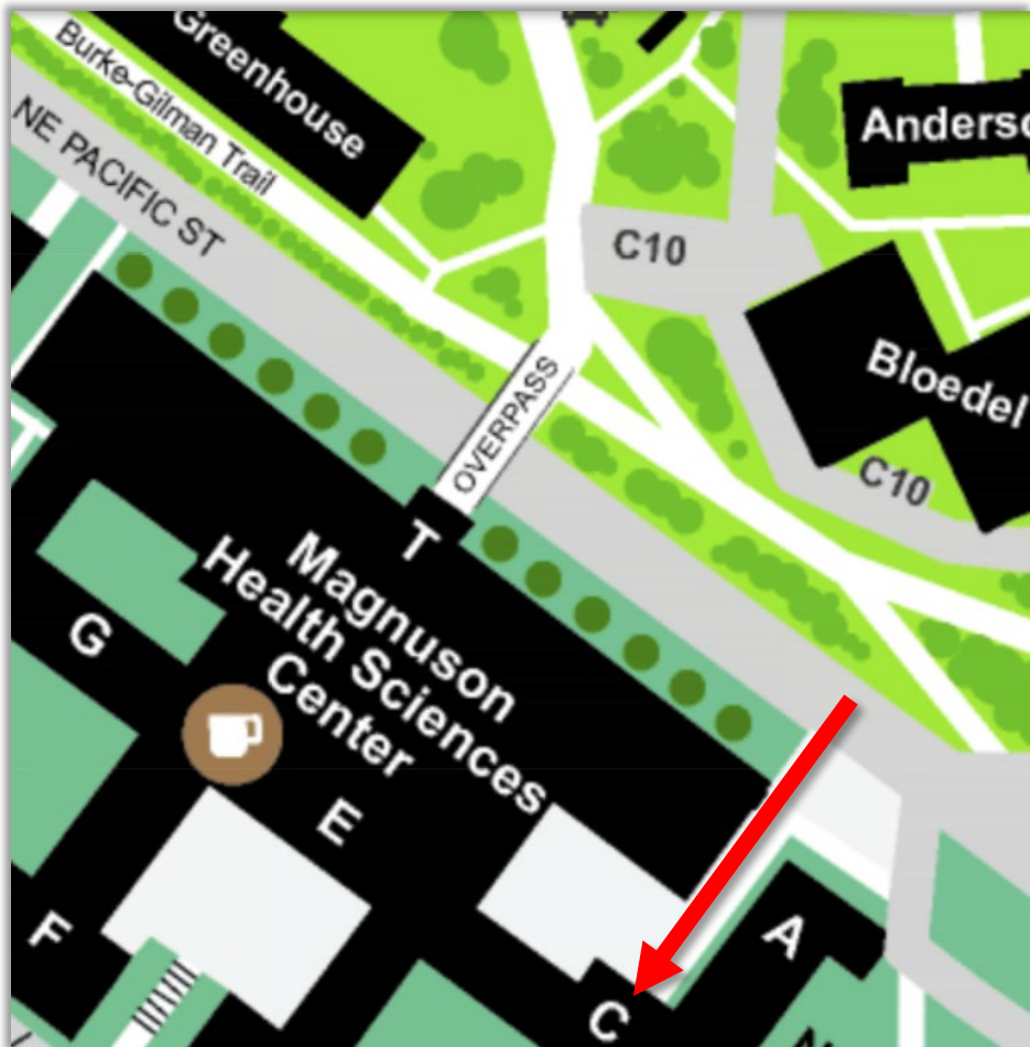
1. Enter the building at street level from NE Pacific Street

1. Enter Health Sciences Building (HSB) from NE Pacific St. at street level through the main lobby entrance (third floor of HSB.) 2. Head down the corridor to your right, toward D-wing . 3. At the D-wing intersection, take the stairs or Elevator 19 on your left to the second floor . 4. Follow signs to T-wing and library . 5. After passing the TV monitor, turn right at the end of the short hallway. Head toward the library. 6. Room T-245 will be on your right.