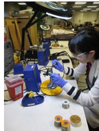
Designated soldering area with fume extractors at each station

For more information, refer to the EH&S focus sheet Lead Safety in Shops and Labs .