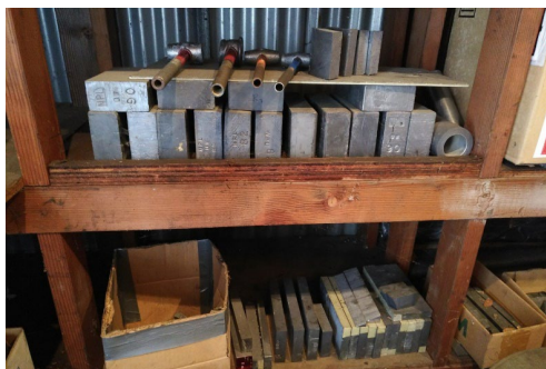
Metallic lead bricks

Metallic lead is used in many different forms including bricks, sheeting, plates, shot and weights. Lead materials can be pure lead (99.9 percent or greater) or be an alloy with other metals. Antimony, tin and arsenic, in quantities of less than 10 percent, are commonly added to metallic lead to give it greater hardness and strength.