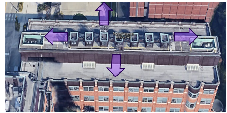
Figure 1: View from the rooftop.

Figure 1 shows an aerial view of the rooftop and where the antennas are located.